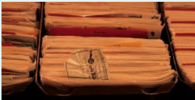
While only about 1 out of every 100 checks bounces, the check return process is slow and costly.

Another very important Federal Reserve response to the EFA was the introduction of new Reserve Bank services to accelerate the return of checks. In effect, the Reserve Banks offered a “safe harbor” for institutions seeking a means to comply with the new requirements. As with the collection of checks, no U.S. depository institution was required to use Reserve Bank services. They could choose to do so, or to use other means. Since the implementation of the EFA, new private check return services and clearing arrangements have evolved. During the first few years after EFA, however, and to an appreciable extent even today, the readiness of the Federal Reserve to complement its regulatory requirements with enabling services has been essential to the successful implementation of the intentions of the Congress.