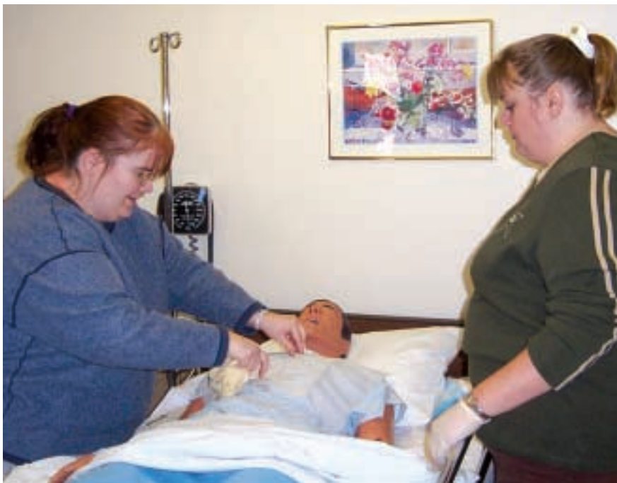
Licensed practical nurse training, sponsored by PACT, addresses central Maine's nursing shortage and gives dislocated workers a path to quality employment.