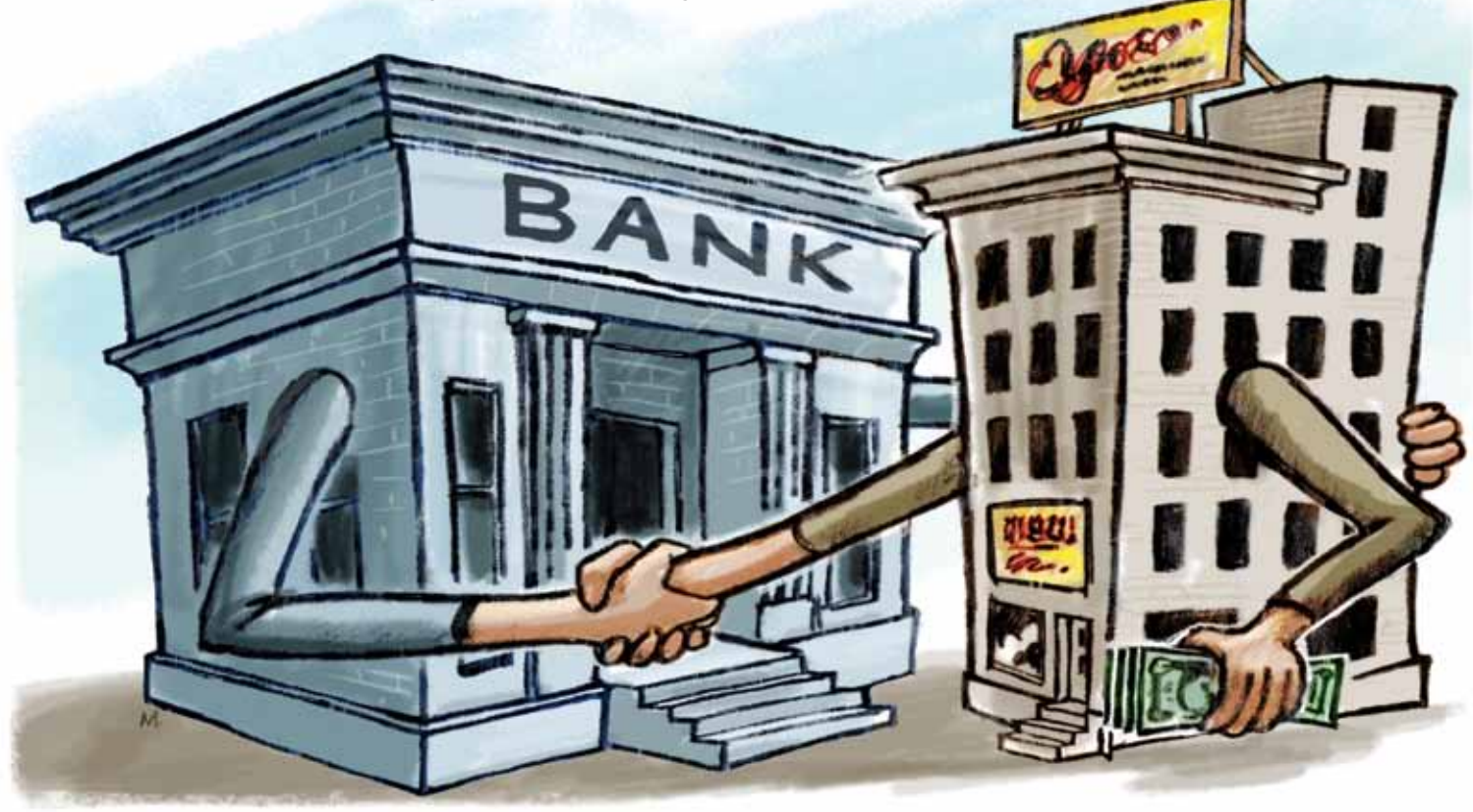
by DeAnna Green, Federal Reserve Bank of Boston

ommunity banks believe they are special.<sup>1</sup> They argue that their strong ties to local communities—whether rural villages or big city neighborhoods—enable them to make a difference economically, despite their small size. And when it comes to small business lending, three recent reports on New England financial institutions tend to support this belief.