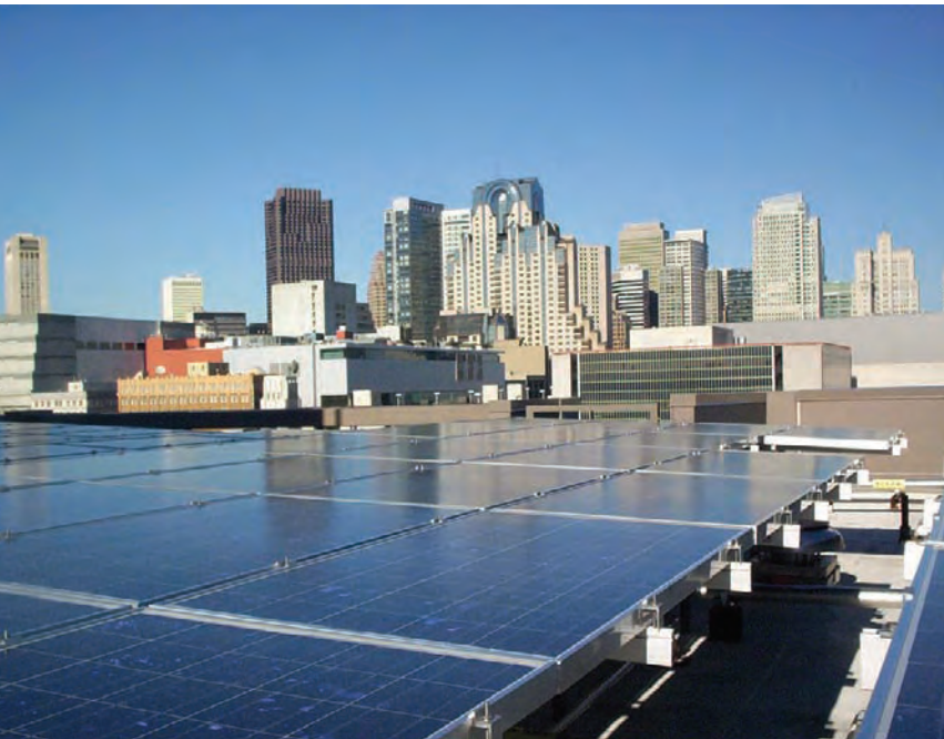
Plaza Apartments in San Francisco. A view of the rooftop solar panels on this mixed-use development that includes low-income housing.