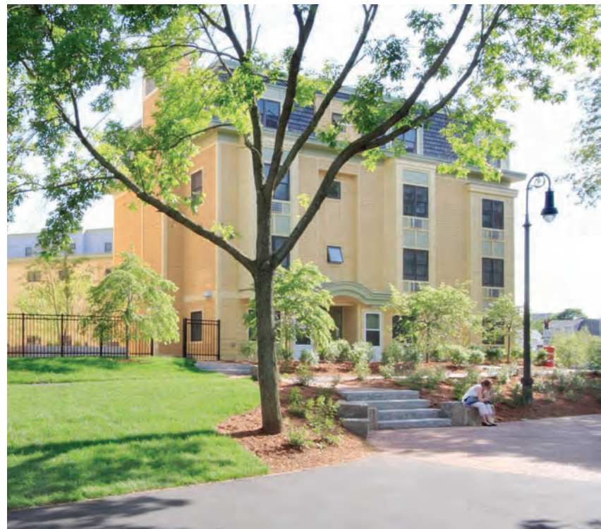
Trolley Square in Cambridge, Massachusetts. Green homes open onto Cambridge Linear Park, a bicycle and walking path.

who pay proportionately more for energy and are disproportionately affected by health problems related to poor air quality. One organization working to bring green affordable housing to scale is Enterprise Community Partners, a not-for-profit institution that provides expertise and financing for affordable housing. This article discusses the case for uniting green and affordable, highlights the first national design and