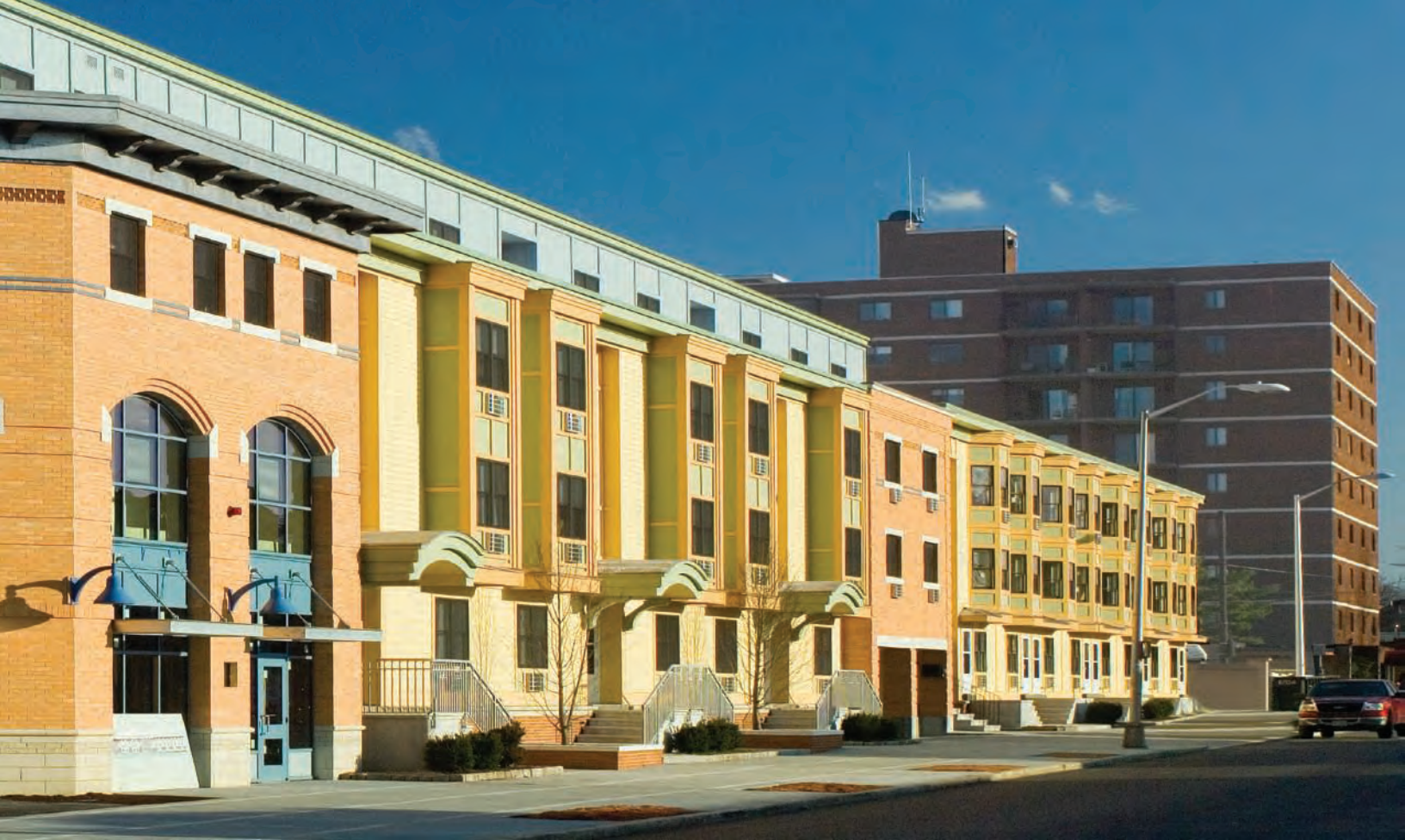
Trolley Square is a green mixed-use development built on the former storage site for the city's trolley cars.

construction criteria for green affordable homes created by Enterprise, and shares some of the lessons the organization has learned to date.