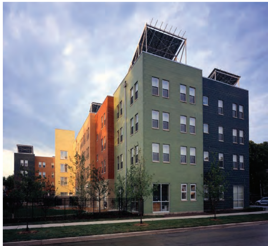
Wentworth Commons in Chicago, Illinois. The newly constructed building is the first supportive housing development in the Midwest to achieve the LEED certification.

Over the last four years, Enterprise has invested more than $570 million in homes that are built or being built according to the Green Communities Criteria, creating more than 13,000 green affordable homes in more than 300 developments in 30 states. The program has tested the potential of integrating green materials and methods throughout the affordable housing development process. These efforts are helping to transform the market and generate long-term health and economic savings to underserved communities. Below we provide highlights of what we are learning in the field.