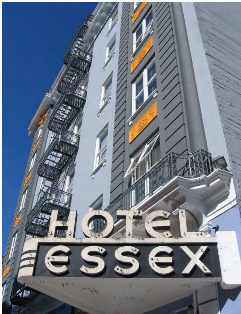
Hotel Essex in San Francisco, California. The seven story hotel has been converted into green apartments for homeless individuals with disabilities.

Galen Terrace received a $56,000 per unit renovation financed with private activity bonds, low-