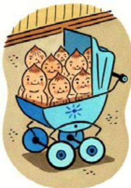
The kewpie doll was a hot collectible item before World War I; more than five million of the ceramic cherubs were sold in just four years.

A collection's true legacy, however, is not the items in it, but the wisdom and beauty the world gains from its having been assembled. Individual collectors find others who share their passions to pass on their knowledge and experience. Institutions share their knowledge with the world through public access, scholarly research, and interpretation. In these ways, the collection—and the collector—will still carry on. ✱