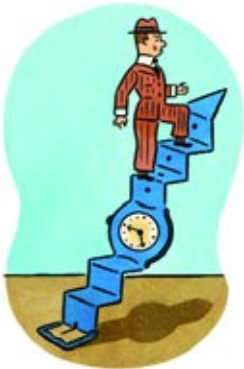
In 1990, a Swatch watch designed by Italian painter-sculptor Mimmo Paladino sold at Sotheby's for just over $20,000. Original retail price, just two years prior: $70.

But neither is it just about the fun. Dedicated collectors are after more than the simple enjoyment of